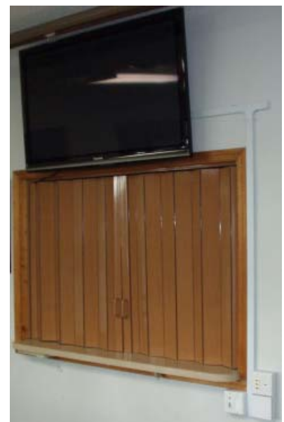
Right: The Panasonic and connection boxes installed. Page 7: Part of the slide show on the new HDTV during the October Membership Luncheon.